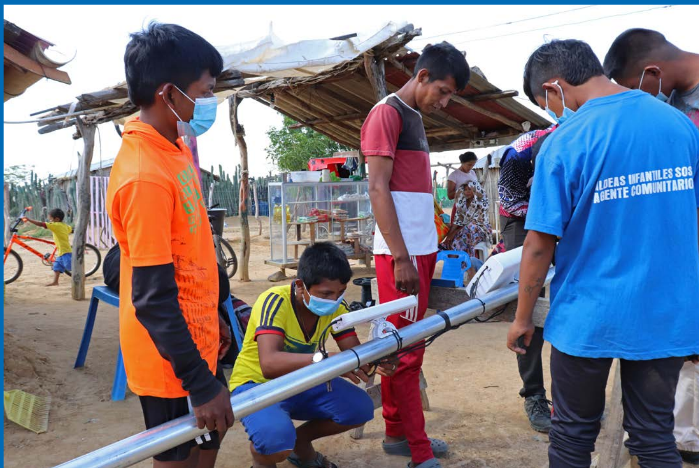
Members of the local community install network equipment for internet connectivity in Uribia, La Guajira, Colombia, in December 2021.

4. Explore innovative and transformative models of extending connectivity in hard-to-reach refugee-hosting areas: In order to extend connectivity to last-mile areas, UNHCR will – together with government, industry and other stakeholders – explore alternative and innovative business models to establish sustainable connectivity, considering inter alia de-risking mechanisms, shared capital investment, etc., building off its own expertise in delivering safe and secure last-mile connectivity to the response community. UNHCR will also explore options for community-led approaches, such as Community Networks, that leverage the skills and capacities of the forcibly displaced and communities that host them to build out connectivity infrastructure locally, ensuring sustainability of interventions.