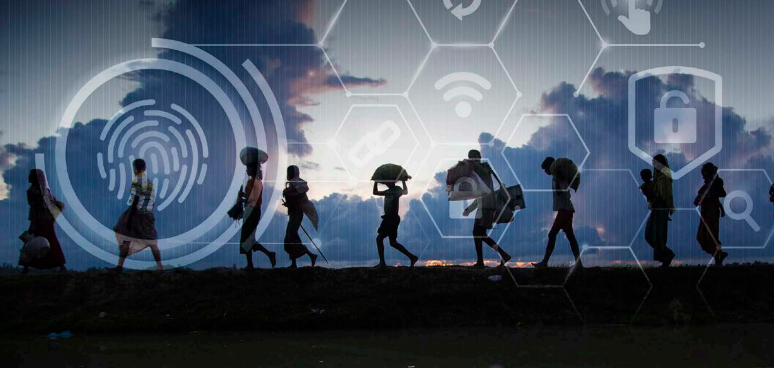
Rohingya refugees fleeing from Myanmar to Bangladesh in October 2017.