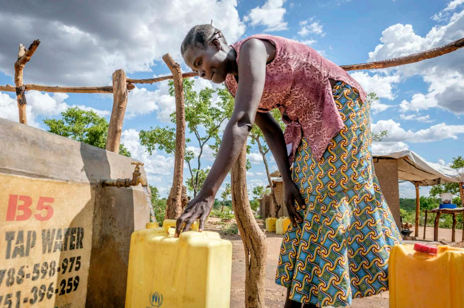
A South Sudanese refugee collects water at Bidibidi refugee settlement in Yumbe district, northern Uganda. The water delivery system uses a series of networked, ultra-sonic water-level sensors that are installed in the tanks of delivery trucks as well as static water tanks in refugee settlements. The sensors provide real-time data on deliveries and consumption. It is based on the “Internet of Things” – physical objects fitted with sensors in order to connect and exchange data over the internet.