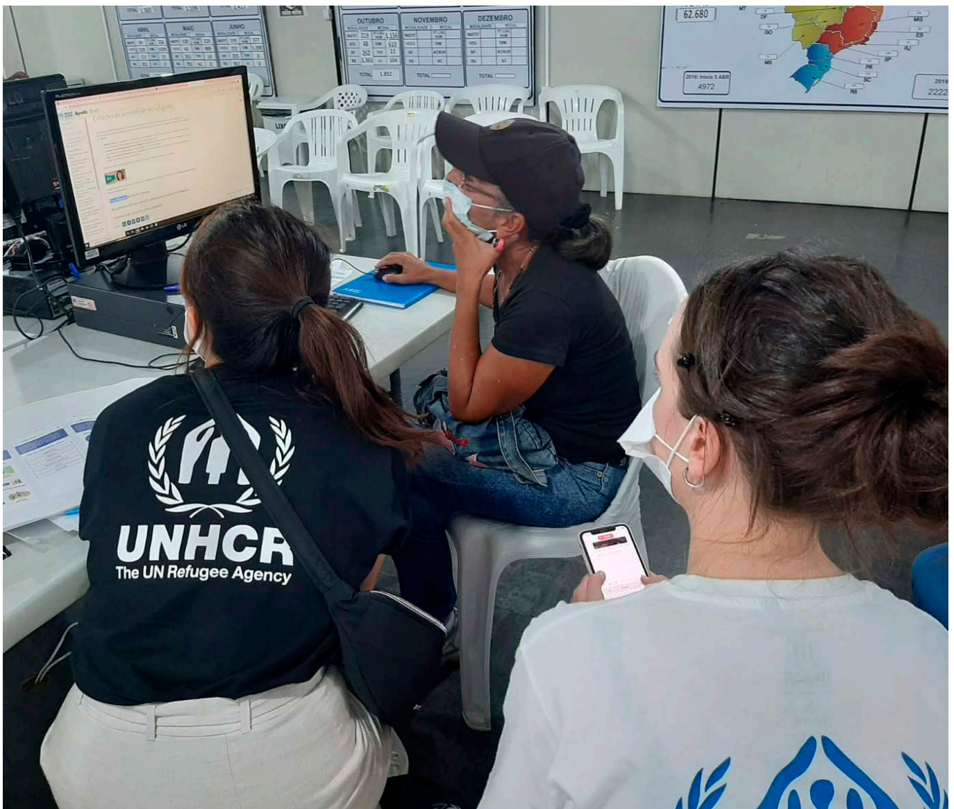
A displaced Venezuelan woman takes part in user research interviews, showing UNHCR colleagues how she researches education and employment opportunities in Boa Vista, Brazil.