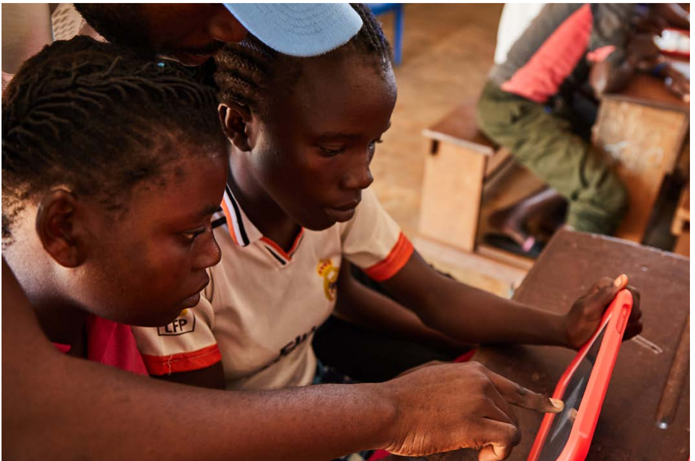
Children in a classroom in Inke camp, Nord-Ubangi, Democratic Republic of the Congo, take part in a lesson that uses electronic tablets. The project, run by UNHCR's partner ADSSE and funded by the Vodafone Foundation, aims to provide digital literacy in camps for refugees who have fled the Central African Republic.

It looks at their journey of interactions with digital technology beginning with increasing understanding, access and adoption of digital technology and channels, and how they use this to access vital services and information to rebuild their lives. Becoming active participants in the digital world brings with it new protection risks. UNHCR's protection mandate is equally relevant in the connected world whether through direct action as an organization to promote an enabling environment that protects or by empowering these communities to be agents of their own protection in digital spaces.